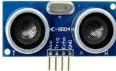
FIG 4: ULTRASONIC SENSOR

The ultrasonic sensor helps in identifying a barrier or anomaly on the track. It operates by reflecting ultrasonic rays and timings of how long it will take to reach an object. In the case of the detection of an object that is not expected or a ribbed surface, the sensor relays data to the Arduino. This provides an extra level of protection in the case of debris or raised sections of track detection which might not be noted in IR sensors.