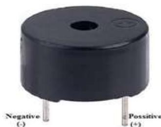
FIG 9: BUZZER

An instant local warning is the buzzer which fires in case a fault has been detected. It serves as a meter of sound, which can be used in the course of test or when the operators are close. This assists in timely detection of the problems without necessarily depending on far distance communication.