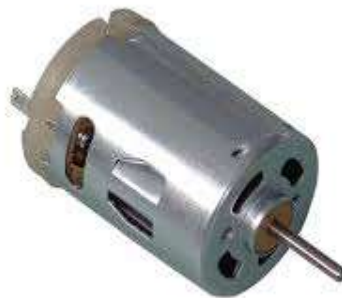
FIG 8: D.C MOTOR

The motors are utilized in the movement of the inspection robot on the railway track. In the left and right motors, one can move the robot to the right or the left enabling it to move along the track effectively. This makes the sensors scan the track all the time as the movement is controlled by them.