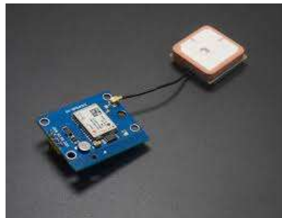
FIG 5: GPS MODULE

The GPS module is used to give real time location information on the system. Once an error has been detected the Arduino asks the GPS module to provide the coordinates and the GPS module includes the values of latitude and longitude. These coordinates play an important role in determining the precise location of the problem in the railway line. This assists the maintenance teams in locating and repairing the problem very fast without having to inspect manually over a lengthy distance.