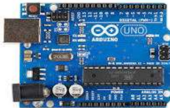
FIG 2: ARDUINO UNO

The main processor of the system is the Arduino Uno. It accepts the sensor input data on IR and ultra sonic modules and processes this input data and then makes decisions based on its programmed constraints. On detection of fault, it gives commands to output devices such as GSM module and buzzer. It also manages the motor driver in order to regulate the movement of the robot in the railway track. The simplicity of its programming and that it can be connected to various peripherals make it appropriate and applicable to real-time embedded systems such as this system.