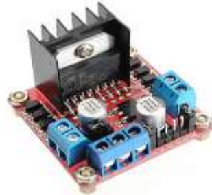
FIG 7: MOTOR DRIVER

The motor driver is used as a connection point to the motors with the Arduino. The Arduino is not capable of providing the current required to power motors, and therefore the motor driver amplifies the signal, and sets the direction and velocity of the motors. It allows the robotic unit to move, turn, or move forward depending on the order of the Arduino.