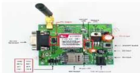
FIG 6: GSM MODULE

Communication is done in the GSM module. On confirming a fault, the Arduino sends control commands to the GSM module to send an SMS notification to predetermined telephone numbers, including the