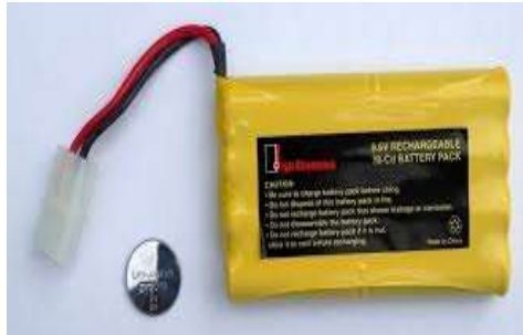
FIG 10: BATTERY

The battery is used to power all the system components. It makes it portable and enables the system to work without any external power source. Constant power supply is paramount in correct sensor measurements and correct operation of communication modules.