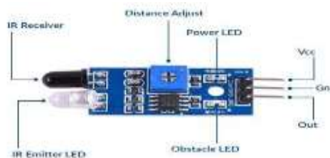
FIG 3: IR SENSOR

The IR sensors are utilized to locate the cracks or discontinuity in the railway track. These sensors operate under the principle of infrared light being emitted and the reflection on the sensors. Due to normal conditions, the reflection is stable however, with the occurrence of a gap or crack, the signal to be reflected