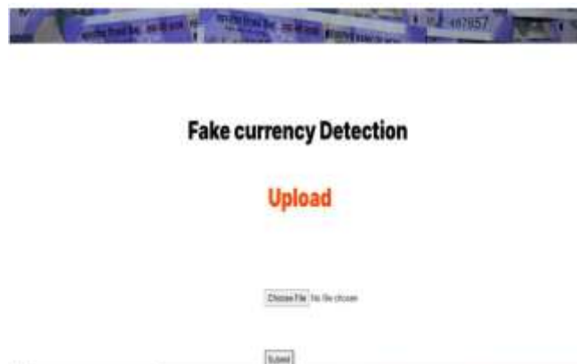
Fig 4: Preview Page with GUI and Push Button