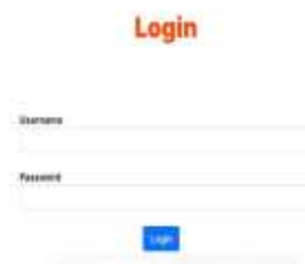
Fig 3: Login Page with User Name and Password Blank