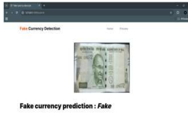
Fig 7: Detection of Fake Currency