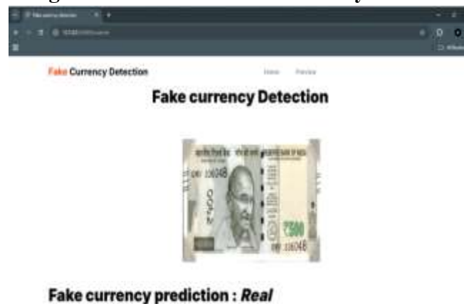
Fig 6: Real Currency Detection