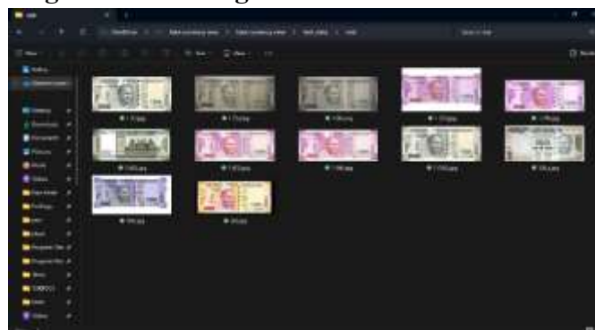
Fig 5: Collection of Fake Currency Datasets