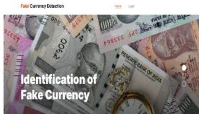
Fig 2: Home Page with Login Page